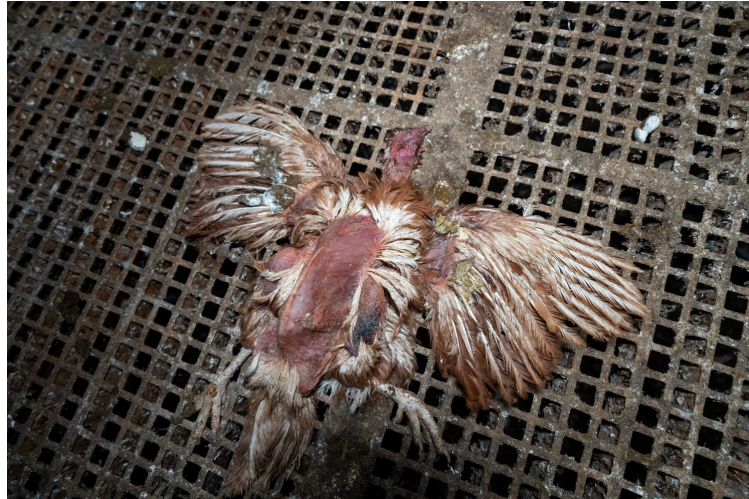
A photo of a dead hen at Josh's Rainbow Eggs.

Major free-range egg producer, Josh's Rainbow Eggs has publicly acknowledged that they have been misleading consumers with claims that they rehome all their ex-layer hens.