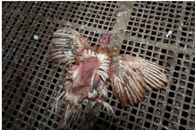
A photo of a dead hen at Josh's Rainbow Eggs.

Major free-range egg producer, Josh's Rainbow Eggs has publicly acknowledged that they have been misleading consumers with claims that they rehome all their ex-layer hens.