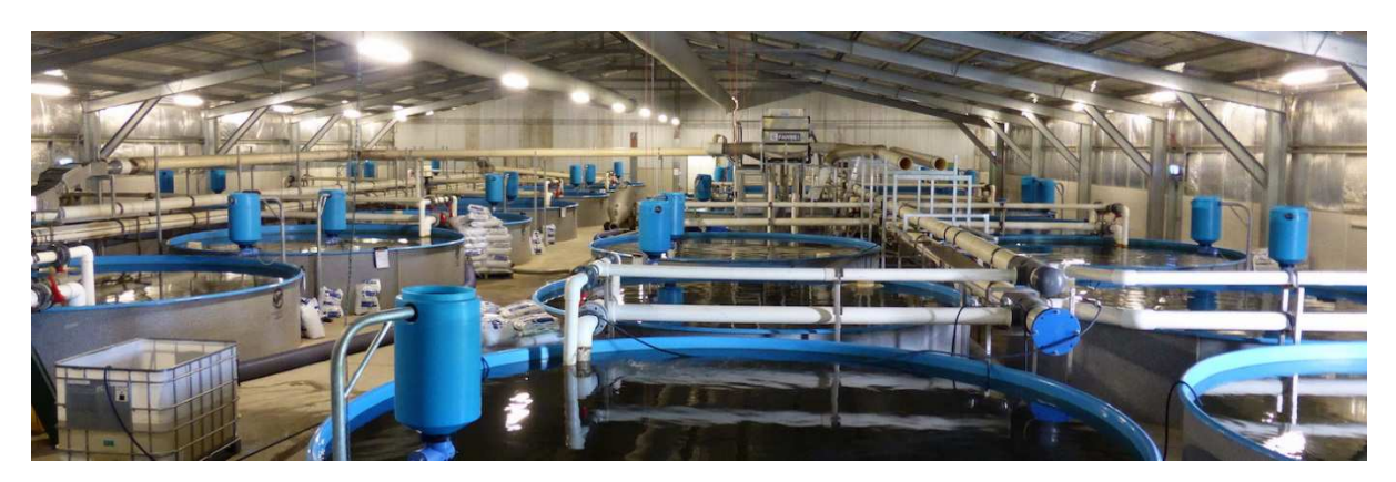
Figure 2 RAS system for Murray Cod production.