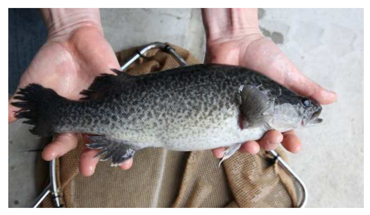
Figure 5 Murray Cod grown in a RAS production system showing 'ratty tail'.

Baily et al. (2005) specifically noted 'the lack of notable or consistent internal changes associated with CUD-affected fish, despite the presence of marked external lesions'. Schultz et al. (2011) found no changes in haematology and blood parameters even in advanced CUD-affected fish, although Schultz et al. (2014) found greater number of rodlet cells in the gills and collecting ducts of the kidneys of CUD-affected fish than in control fish.